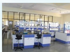
Genetics Plant Breeding