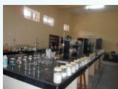
Soil, Science & Agriculture Chemistry