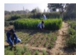
Herbal Garden & Practical Farm