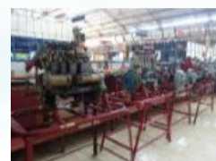
Farm Machinery & Power