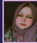
KHUSH NABA Comsats university Islamabad Lahore campus

THURSDAY, 27 JUNE 2024 | 4:30 to 5:30 PM